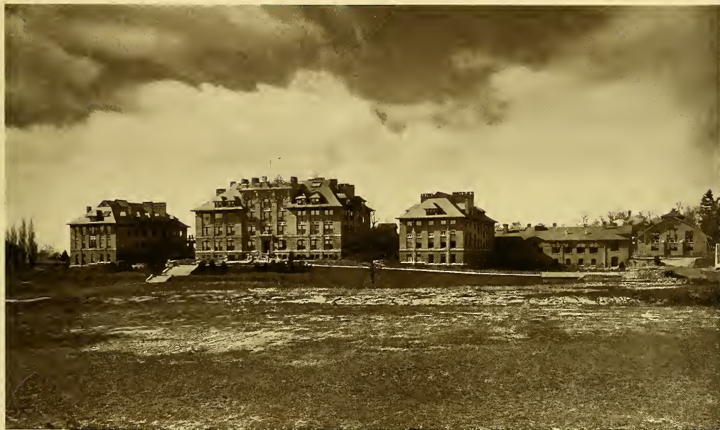
THE NEW YORK STATE COLLEGE OF AGRICULTURE—SOUTH SIDE OF NEW QUADRANGLE